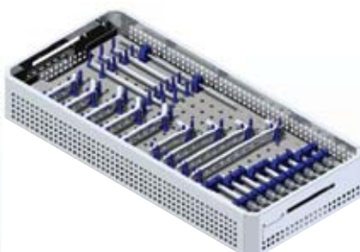
SLIDING SCREW - THREAD 28mm TORNILLO DESLIZANTE - ROSCA 28mm PARAFUSO DESLIZANTE - ROSCA 28mm